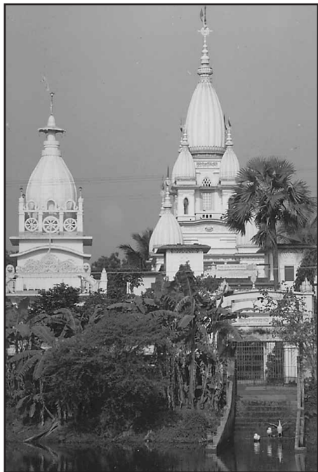
Sri Chaitanya Saraswat Math, Nabadwip Dham, India