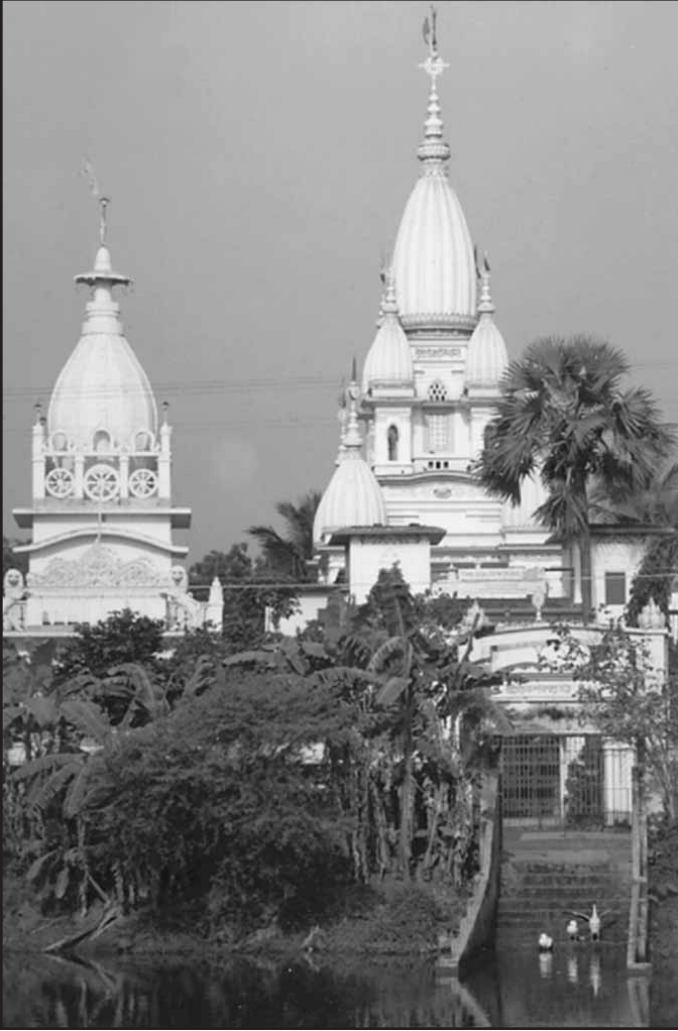
Śrī Chaitanya Sāraswat Maṭh, Nabadwīp