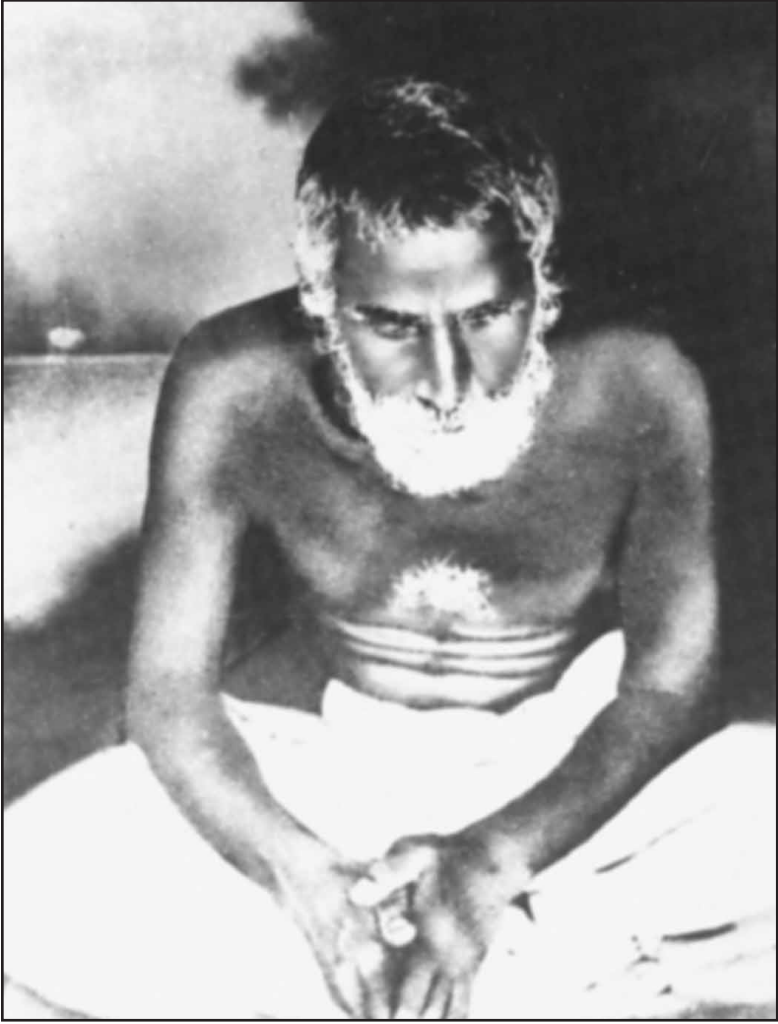
Śrīla Gaura Kisora Dāsa Bābajī Mahārāj