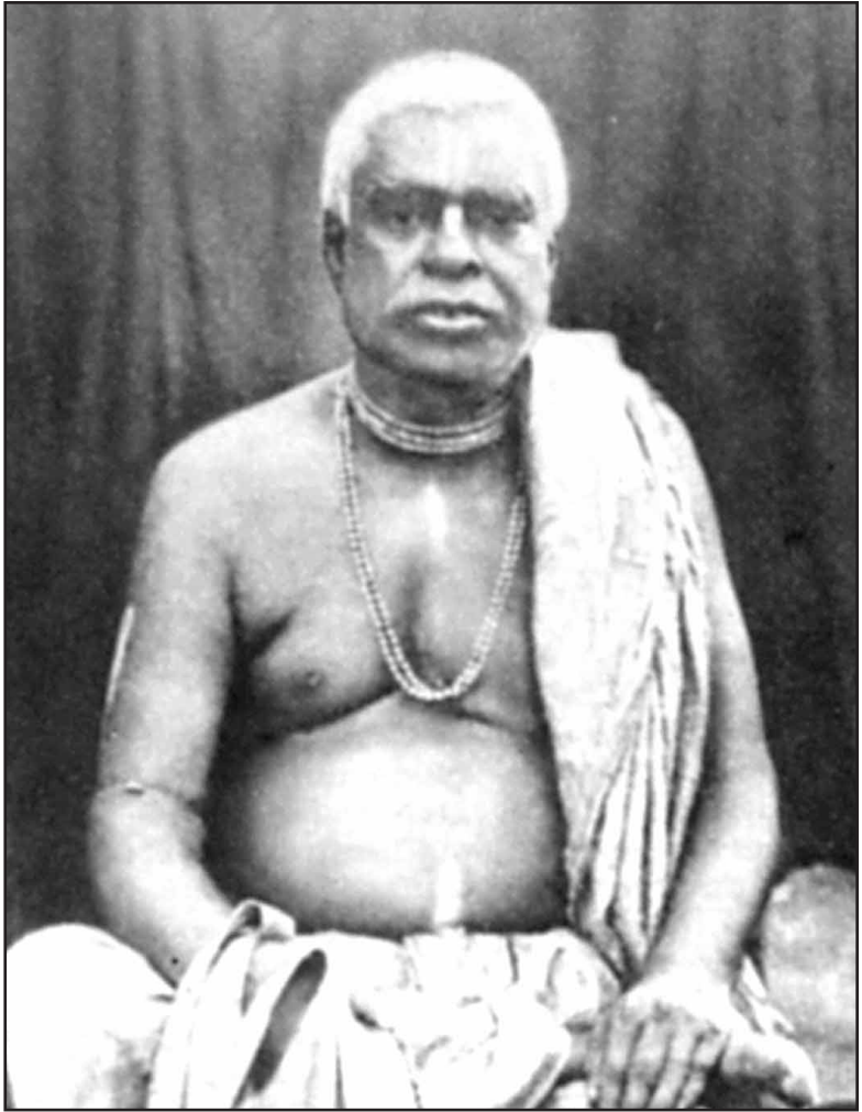
Śrīla Bhaktivinoda Thākura