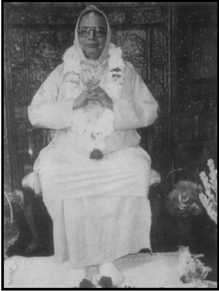
Om Viṣṇupād Śrī Śrīla Bhakti Sundar Govinda Dev-Goswāmī Mahārāj Sevāite and President-Āchāryya of Śrī Chaitanya Sāraswat Maṭh