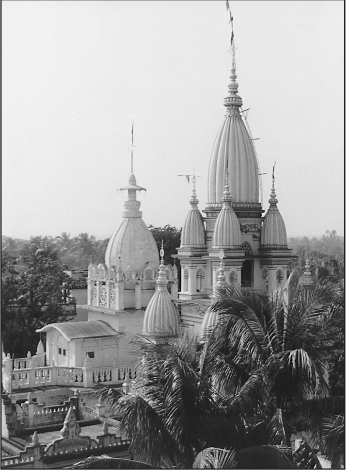
Śrī Chaitanya Sāraswat Maṭh Śrī Dhām Nabadwīp