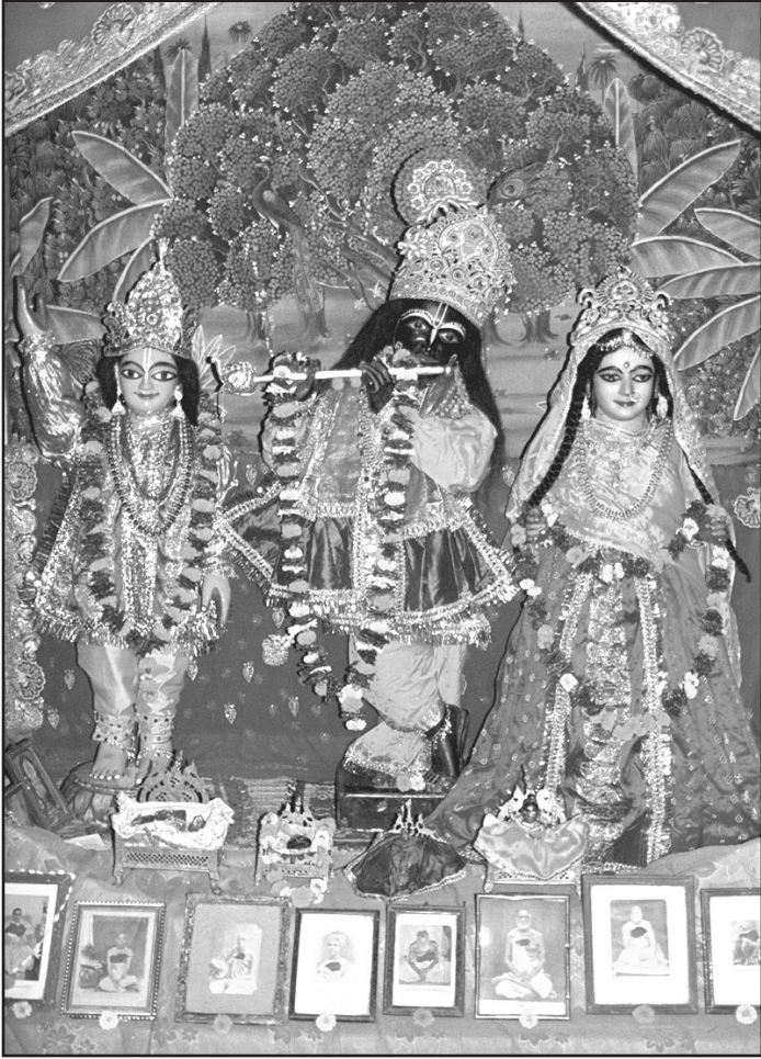
Śrī Śrī Guru-Gaurāṅga-Gaṇḍhārva-Govindasundarī Nabadwīp Śrī Chaitanya Sāraswat Maṭh