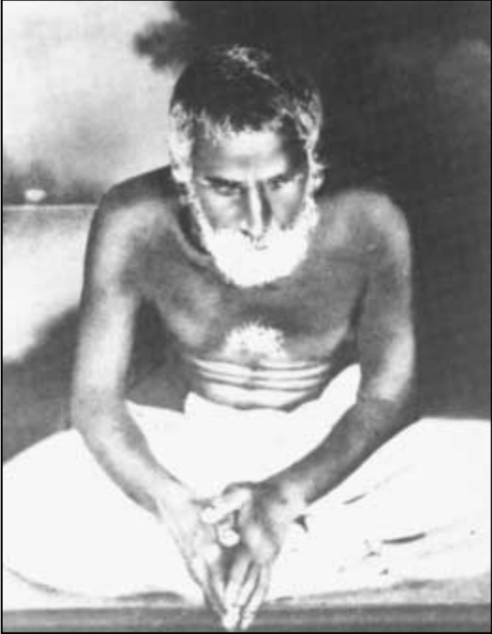
Śrīla Gaura Kīśora Dāsa Bābāji Mahārāj