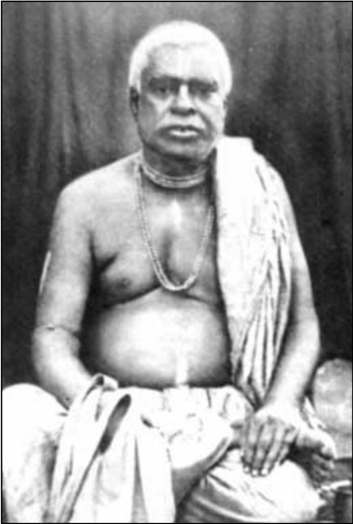
Śrīla Bhaktivinoda Ṭhākura: nineteenth century founder of the Krishna consciousness movement.