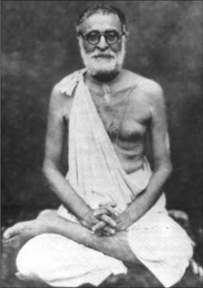
Śrīla Bhaktisiddhānta Sarasvatī Ṭhākura