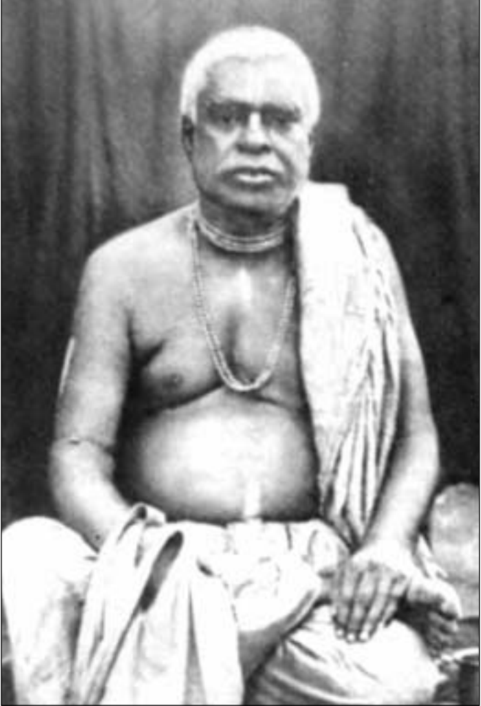
Śrīla Bhaktivinoda Ṭhākura