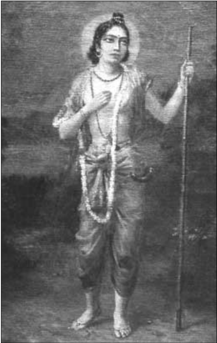
Śrīla Nityānanda Prabhu, the original spiritual master and general representation of guru .