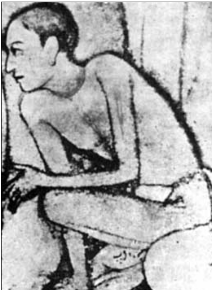
Śrīla Rūpa Goswāmī, the bhakti-rasāchārya , giver of the rāgānuga-śāstras .

is no entrance of any mundane exploitation or renunciation, and not even legalized śāstric devotion. The highest kind of devotion is not controlled by any law. It is spontaneous and automatic. Sacrifice to the highest