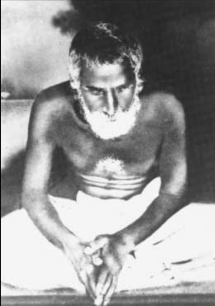
Śrīla Gaura Kīśora Dāsa Bābājī Mahārāj