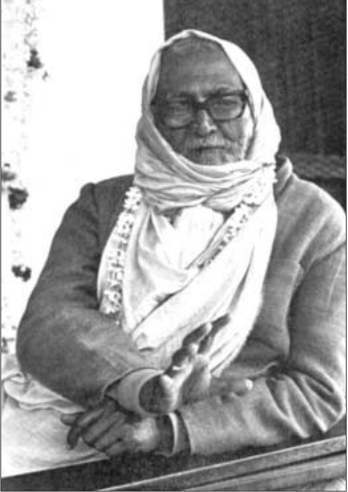
Founder-Āchārya Śrī Chaitanya Sāraswat Maṭh Śrīla Bhakti Rakṣak Śrīdhar Dev-Goswāmī Mahārāj