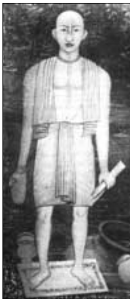
Baladeva Vidyābhūṣaṇa presented the Govinda-bhāṣya commentary on Vedānta philosophy. His enlightened thought is a valuable contribution to our sampradāya .

Śāstra-guru , śikṣā-guru , dīkṣā-guru , and nāma-guru are all taken together; in this way a real channel has been given to save us, to keep up the flow of the highest truth from that world to this world. This policy has